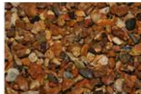
New Forest Flint